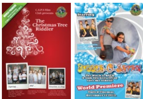
Previous Cannes program movie poster examples

Cannes program films are Professionally Edited with Sound Design